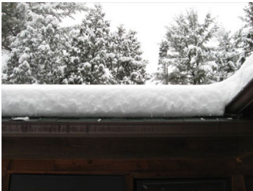
Ice Blaster Edge Melt System Hidden Heat after 8" snowfall